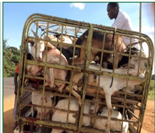
Overloaded goats in Kenya