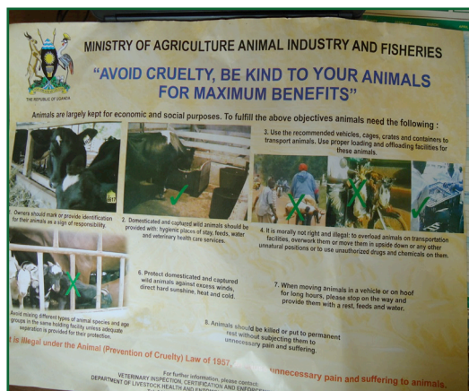
Animal welfare information dissemination poster in Uganda