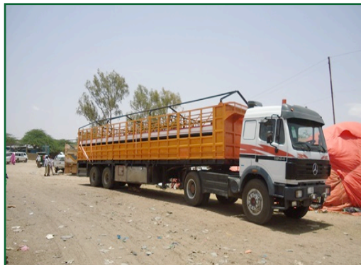
Specialized 2 tier sheep and goats truck in Somaliland