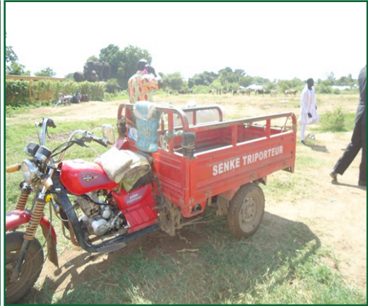
Tri-cycle cattle carrier in South Sudan