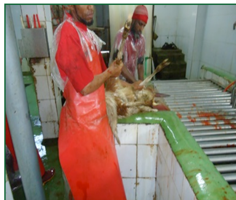
Halal cutting of the neck in Ethiopia