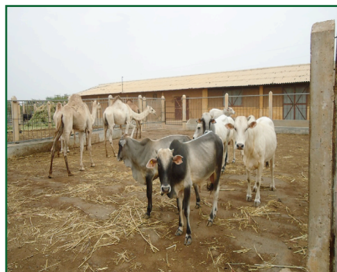
An animal pen in Sudan Veterinary Research Institute