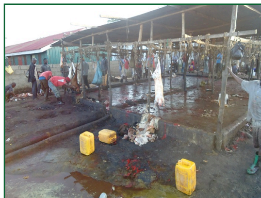
Slaughter premises in South Sudan