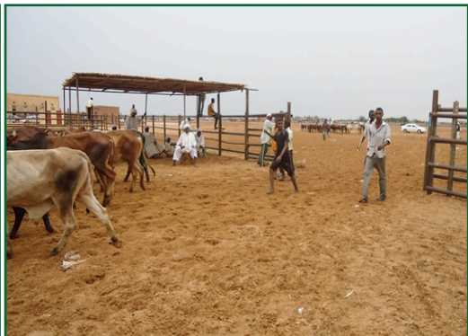
Sudan Almoueleh livestock market, the largest in the region