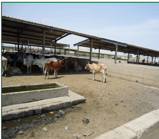
Djibouti livestock market, a model in management and welfare facilities