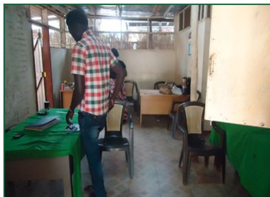
Well-equipped clinic in South Sudan