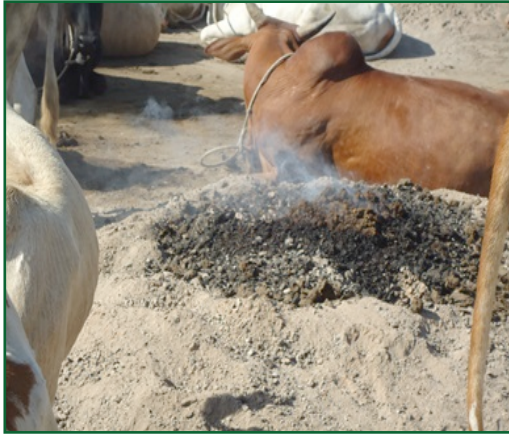
Manure fire to keep off biting insects in a cattle camp in South Sudan